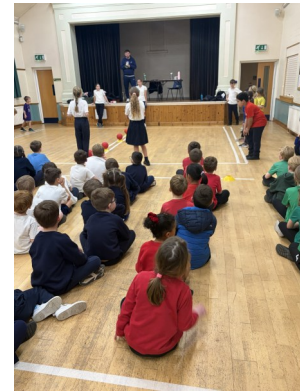
Year 1 / 2 dodgeball comp at St Ipps. The children were brilliant.